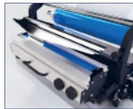
Removal in few seconds