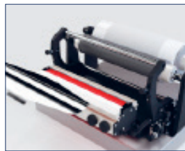
Quick change of chamber