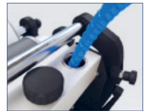
Manual filling and refilling or connection to an ink pump