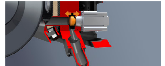
Quick empty functionality