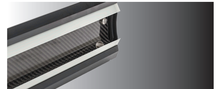
Integrated side nozzles